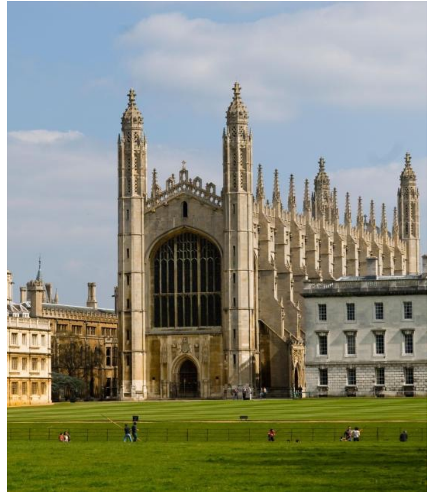
King's College Chapel, University of Cambridge.