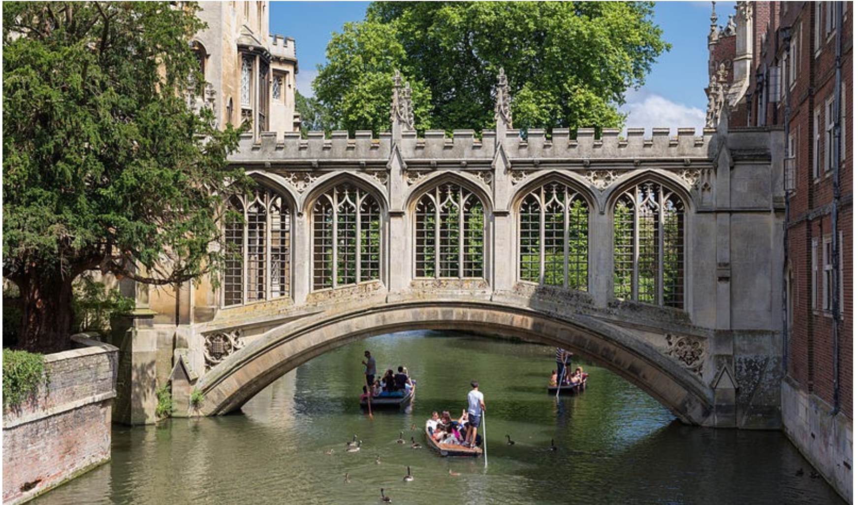
‘The Bridge of Sighs’, St. John’s College, Cambridge

https://commons.wikimedia.org/wiki/File:Bridge_of_Sighs,_St_John%27s_College,_Cambridge,_UK_-_Diliff.jpg