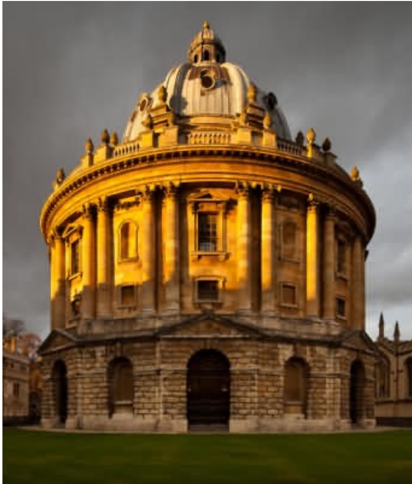
The Radcliffe Camera, University of Oxford.